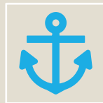
United States Merchant Marine Academy