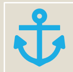
United States Merchant Marine Academy