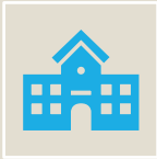
United States Military Academy – West Point