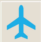
United States Air Force Academy