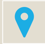
United States Naval Academy