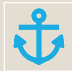
United States Merchant Marine Academy